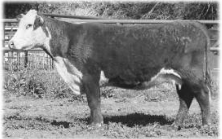
LONK DOMINET 0332 • Dam of Lot 131

Out of one of our very best producing cows his WI is 116. This bull combines the low birth, growth and carcass that so many Hereford breeders seek. Look him over for your next herd bull.