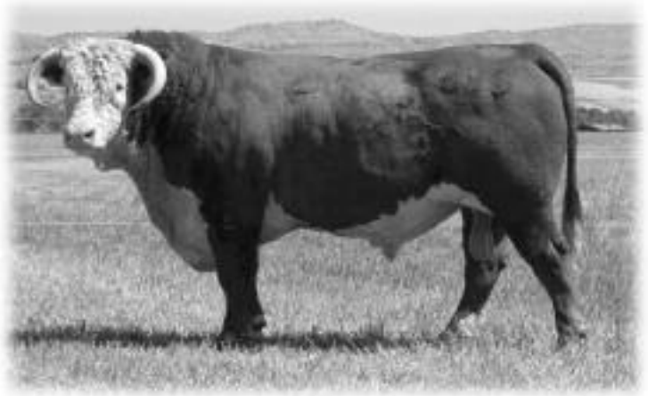
CL 1 DOMINO 285M

285M is regarded by many as one of the very top proven total performance sires in the breed. He is a trait leader for yearling weight, milk, milk and growth and marbling. When you do a sire sort for low birth, high growth sires with a lot of carcass, he comes straight to the top. We purchased the spring possession in him a year and a half ago. We could not be more pleased with his first calves. Owned with 4L Farms and Churchill. Selling 1/4 interest and spring possession.