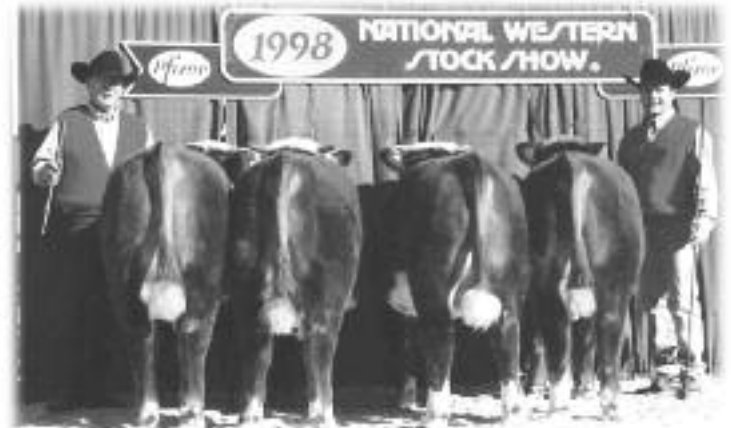
1998 Denver Pen of Herefords

A bull that fits anyone's program that has a 107 WI, a 108 YI and then scans 109 REA, 106 IMF. Combined with his low birth EPD & weight he really is the total package.