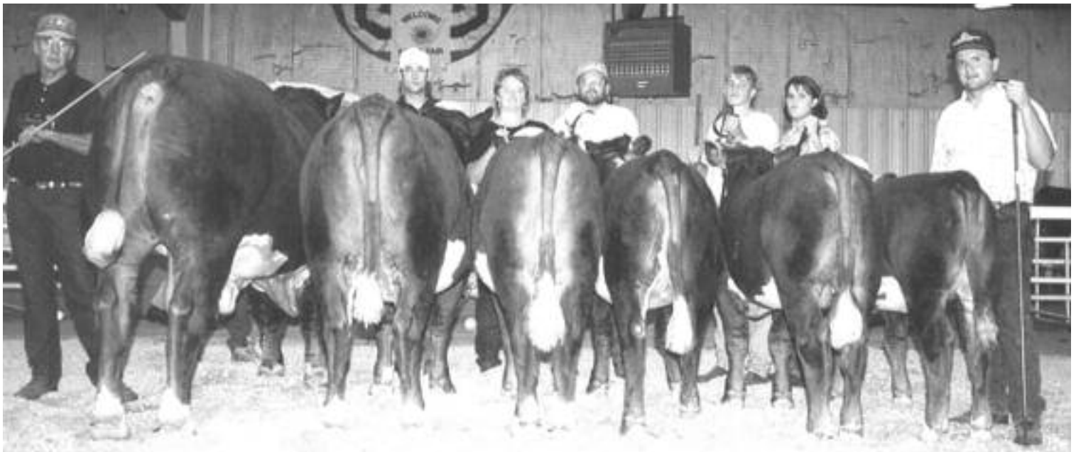
Best 6 head