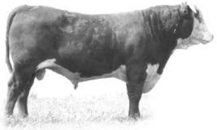
CL 1 Domino 5101E • Sire of Dam of Lot 145

Another of those total performance bulls that has a WI of 113 and then a YI of 109. When you add in a REA ratio of 112 and IMF of 107 you know you have the total package.