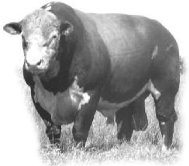
Gerber Granger 13G

Granger breeds light birth weight with explosive growth, along with that early sexual maturity and fleshing ability. He is a full brother to Watchfire which has a lot of breeder acceptance. He has certainly had a place here being used on first calf heifers and for his carcass merit. The Granger females have made exceptional cows.