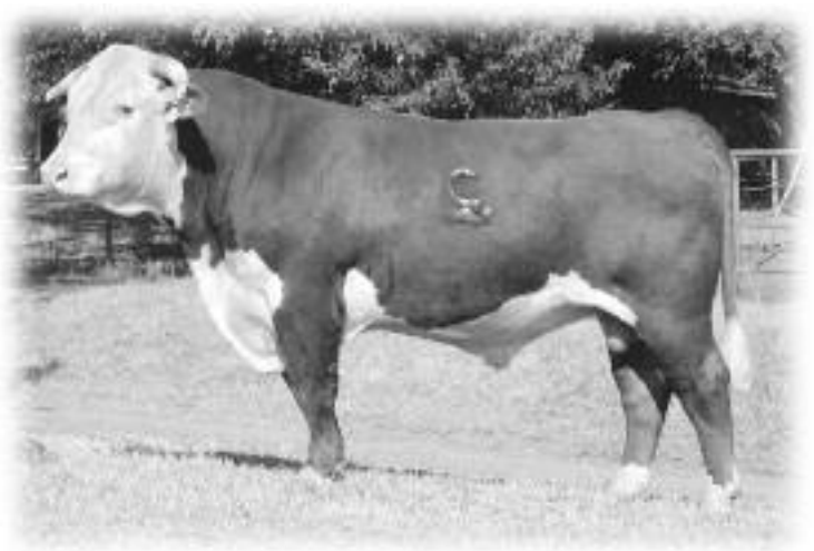
Lonk Ultimatum Domino 0323