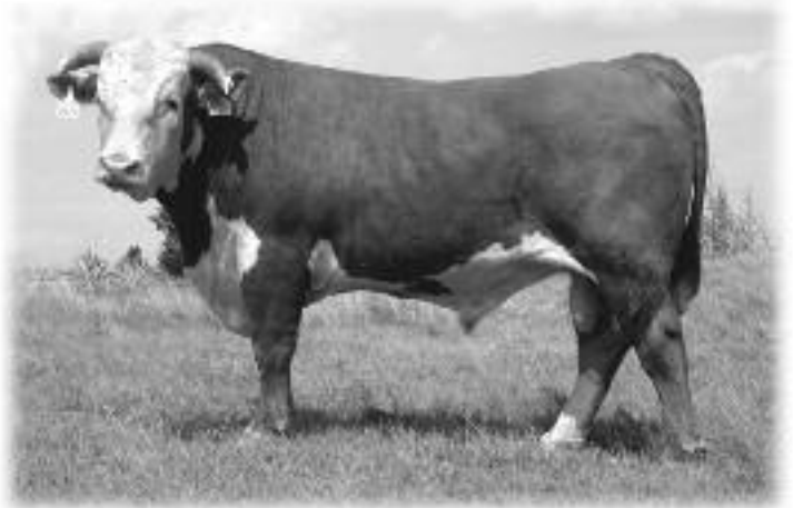
B&D L1 Domino 0098 • Maternal Sire of Lot 136

Probably the highest YI at 108 in this group. Combined with the low birth EPD you really have to appreciate his kind. He even scanned a REA ratio of 104.