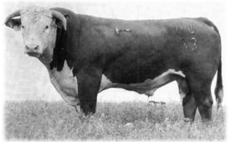
CL 1 DOMINO 0033 1ET • Maternal Sire Lot 140

A good solid bull that held his own with the group.