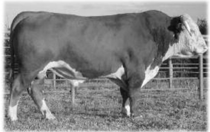
DK Monument L1 109 • Maternal sire Lot 146

These Ultimate bulls seem to be somewhat alike as this bull has performed well. His WI-106, YI-101, REA-113 and IMF-114 certainly puts him in the top of this set of bulls.