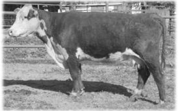
LONK DOMINET 0325 • Dam of Lot 133

Certainly a low birth weight bull that has a lot to offer with balanced traits all the way thru. His dam has been one of my favorite cows-- moderate framed, easy fleshing and a good milker.