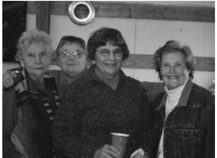
The Kitchen Crew—Thanks!!

After starting out at 58# he has really developed into a bull that indexed 108 at yearling. Then he put up carcass scans of 102 REA and 108 IMF. A bull that could be your next heifer bull.